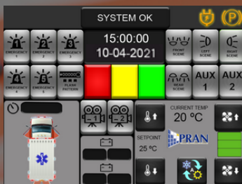
Front 8.4" screen design