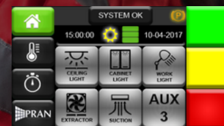
Rear 4.3" screen design